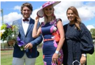
Locals dominate the Geurie fashion scene NEWS