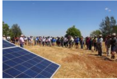
Narromine leads the solar irrigating boom NEWS