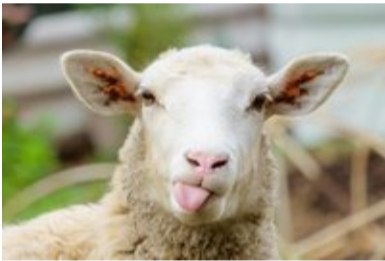
Yarding up by 1600 at saleyard NEWS