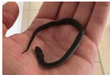
Baby snakes are on the way NEWS