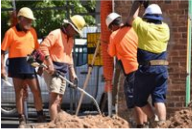
Work gets underway on new medical centre NEWS