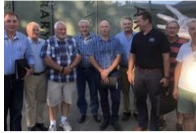
Council cedes to aircraft lobbyists in parking... NEWS