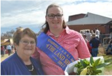
Grenfell Showgirl heads to Zone NEWS