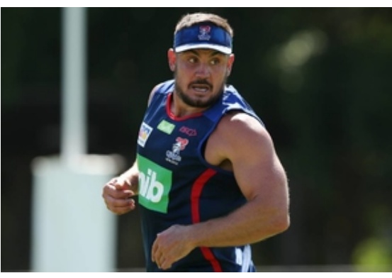
Veteran hungry for call-up LOCAL SPORT