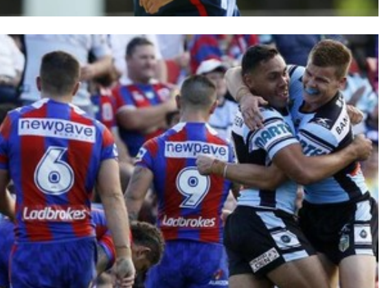
Knights pinch Sharks star