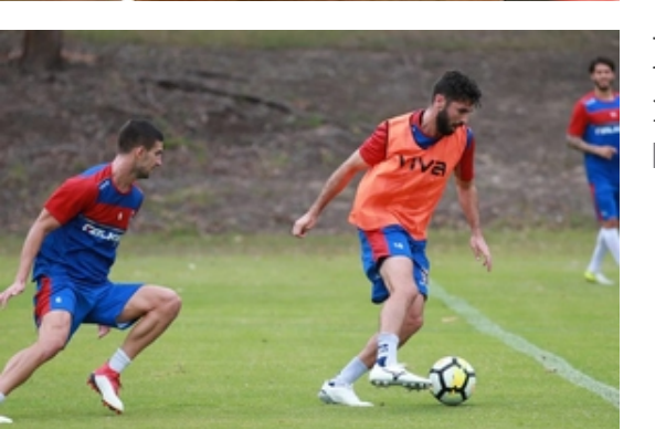
Home security: Jets sure up local talent with new deals LOCAL SPORT