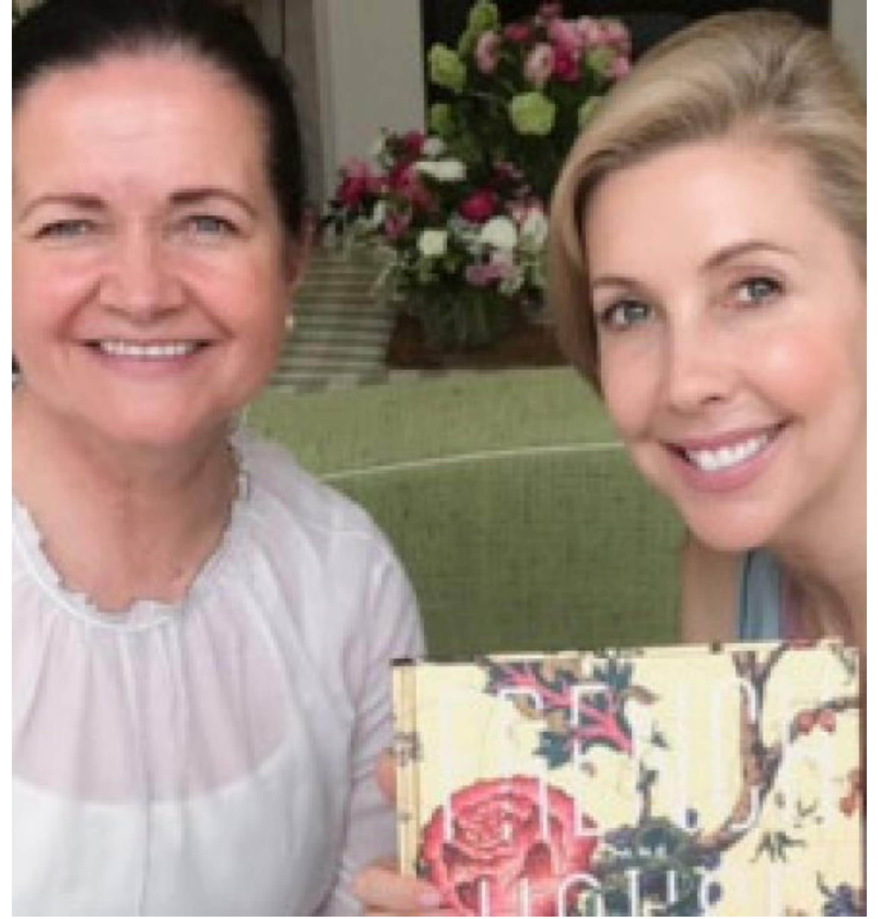
French House Chittlings://www.stoenneystoropheheben/hiehch-house-chic/)