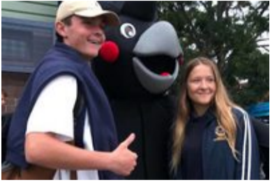
Navy and community back Nowra students' high... COMMUNITY