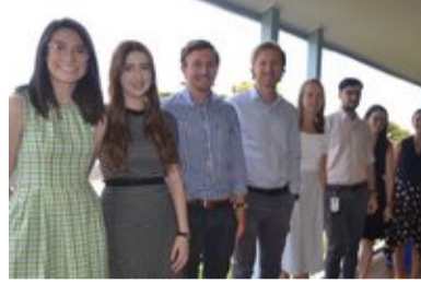
Students on Eyre to look at rural health COMMUNITY