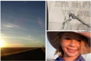
Heed Dolly's drawing to 'speak even if your voice...' OPINION