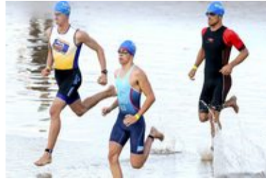
Move quickly to enter the TRI SPORT