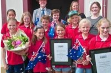
Australia Day ceremony Robe | PHOTOS NEWS