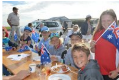
Australia Day breakfast Robe | PHOTOS NEWS