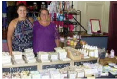
Health, Harmony and Happiness Festival on again NEWS