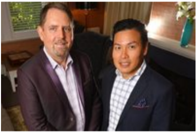
Small hotel's business success NEWS