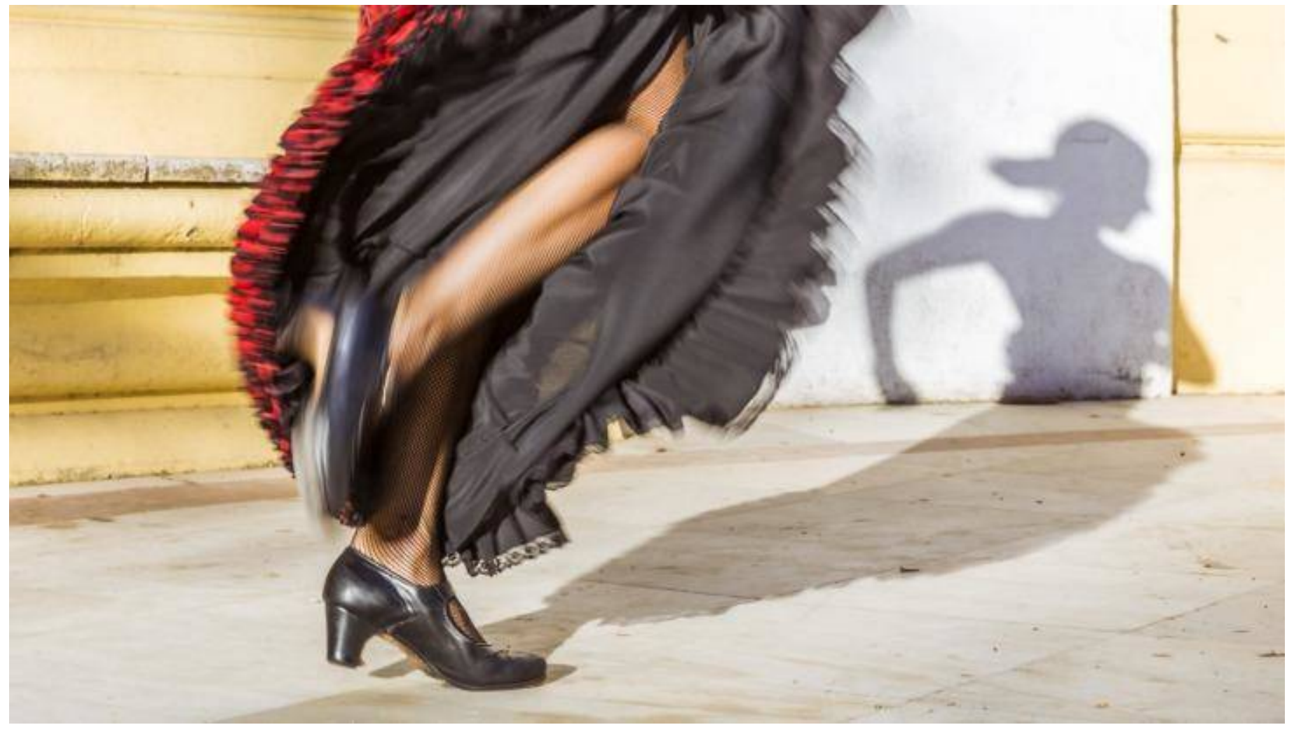
Flamenco classes are on offer in Granada, Spain.

Watching the world go by from a cafe table has its charm, but travel works best when it's hands-on. Here are 10 energising suggestions.