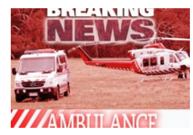
Crash on Calder freeway slows traffic near...