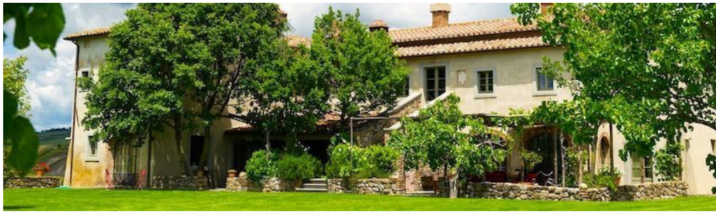
Bellorcia via tuscookany.com