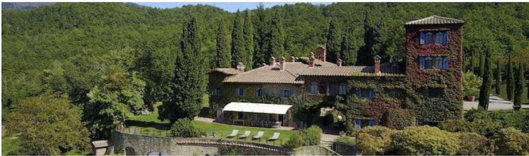
Torre del Tartufo